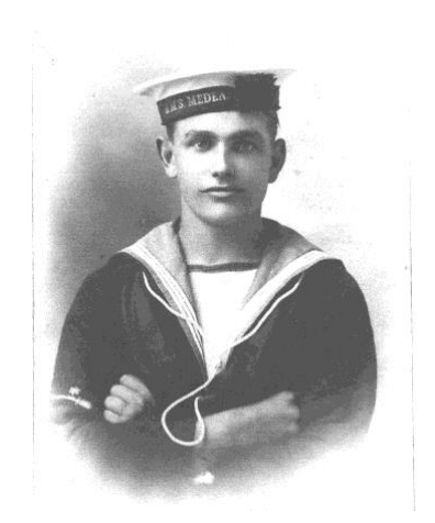
31st December 1915

A report in the Cambrian News states that the following: