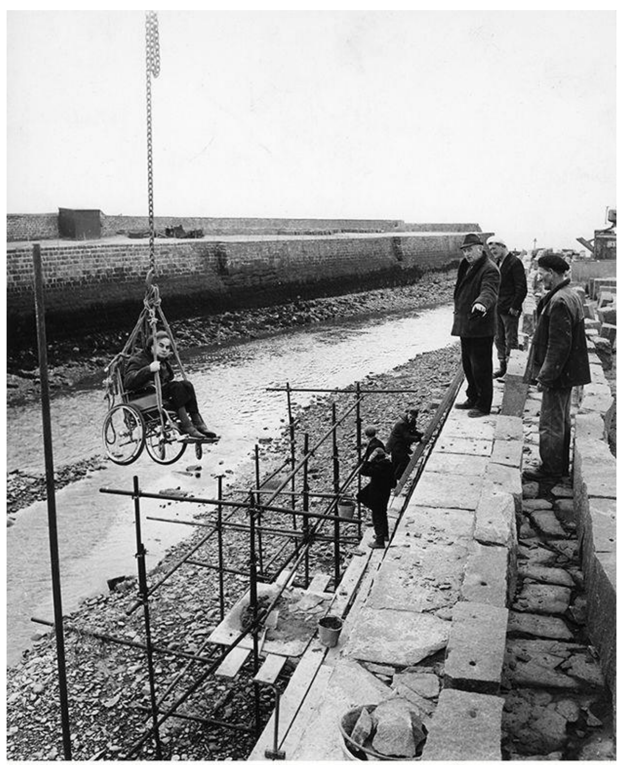
Ron Gets a birds eye view of the harbour works in the 1960s