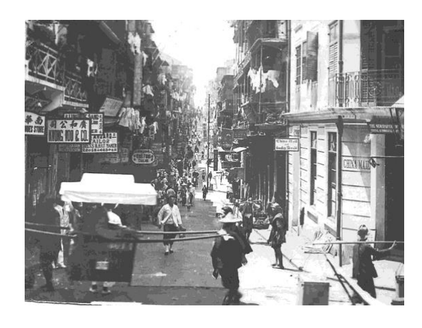
Street Scene in Hong Kong