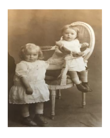
Hugh fair haired, Ceinor dark