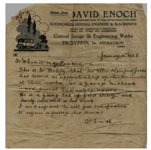
Letter of 1936 confirming Allen had Completed a Garage Mechanic Apprenticeship