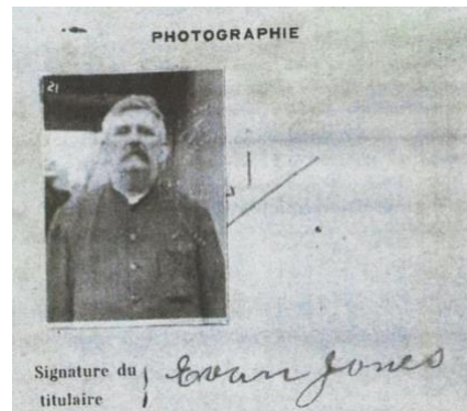
Photo & Signature in his Handbook