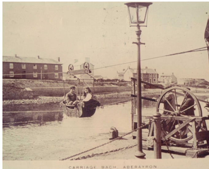
Carej Bach (initially a two-seater)