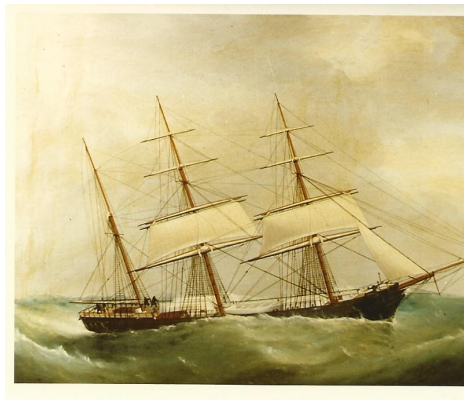
Catharina Maria